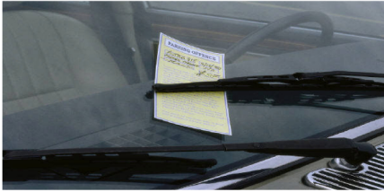
PARKING TICKET FOR ILLEGALLY PARKED

There are numerous reasons for receiving a parking citation. This brochure will outline the major reasons vehicle owners receive parking tickets and provide suggestions for avoiding citations in the future.